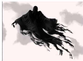
"Dementor" from Harry Potter series